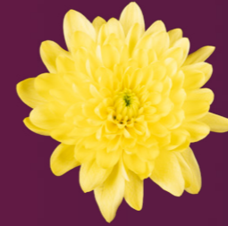
Pina Colada Yellow