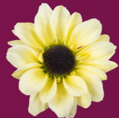
Yin Yang Cream