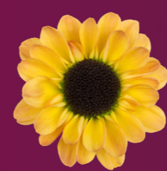
Yin Yang Golden