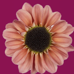
Yin Yang Smokey