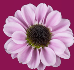
Yin Yang Pink