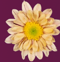
Serenity Sweet Peach