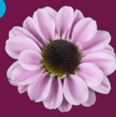
Yin Yang Pink