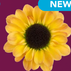
Yin Yang Golden